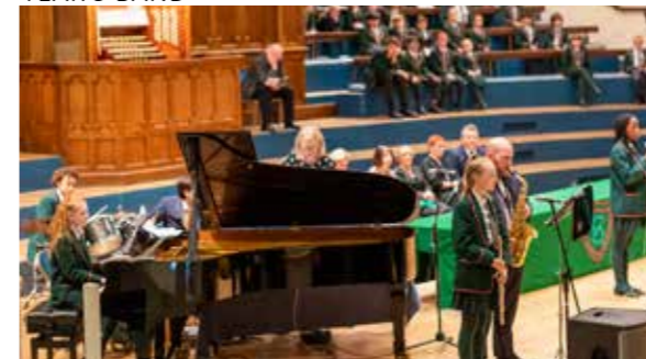
YEAR 9 BAND