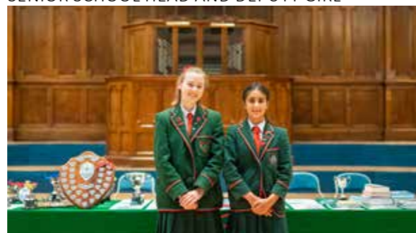
SENIOR SCHOOL HEAD AND DEPUTY GIRL