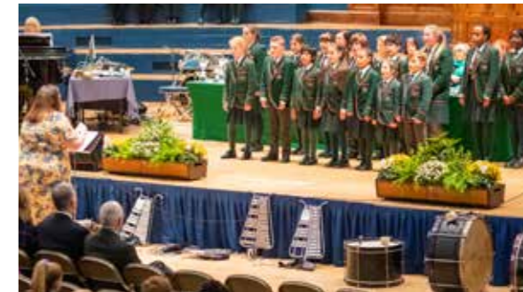
JUNIOR SCHOOL CHOIR