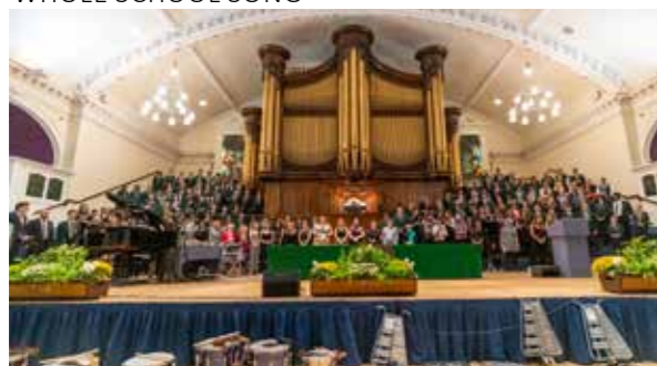
WHOLE SCHOOL SONG